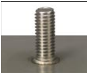
Small, regular and spatter-free collar