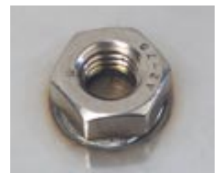
Nut welding on non-punched sheet metals

SOYER top-of-the-range products awarded the following prizes for