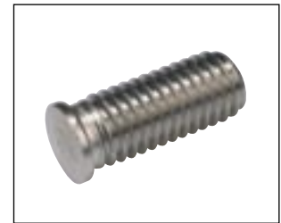
Low-cost welding studs of premium quality