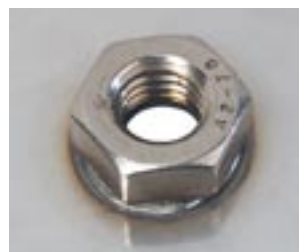
Nut welding on punched sheet metals