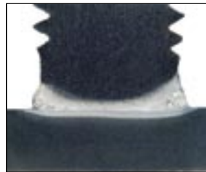
Narrow fusion zone. No arc blow effect